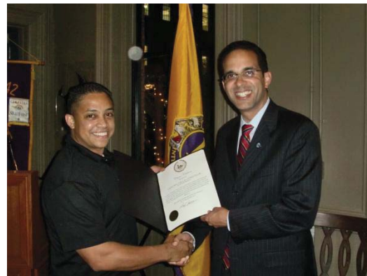
King Lion Winston and Providence Mayor Angel Taveras

District 42 is proud to welcome the Central Falls Lions.